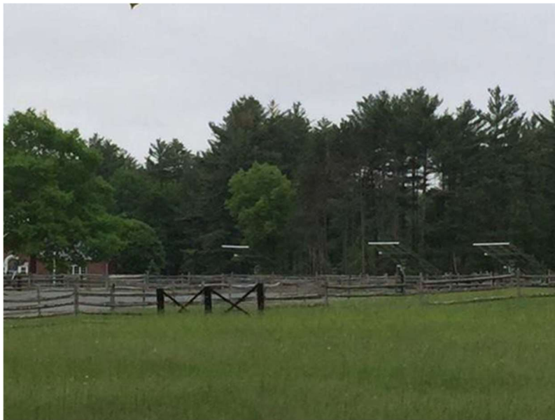
Pole-mounted system – agricultural site.