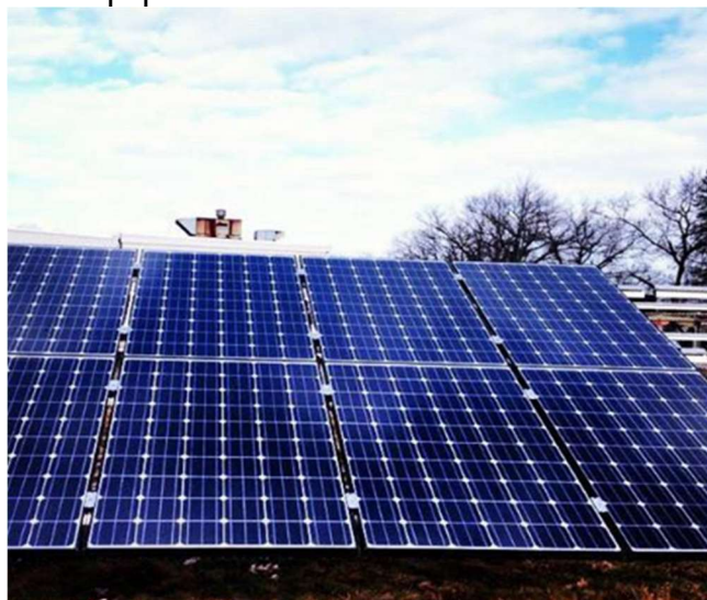
Completed installation showing gaps between panels

This appendix includes images and information about several types of solar installations and equipment.