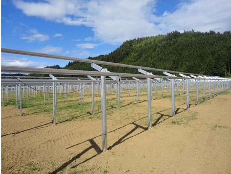
Racking equipment – before panel installation.