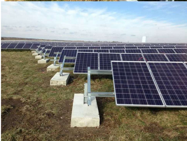
Ballasted system, showing the distance between rows and the ballast blocks.