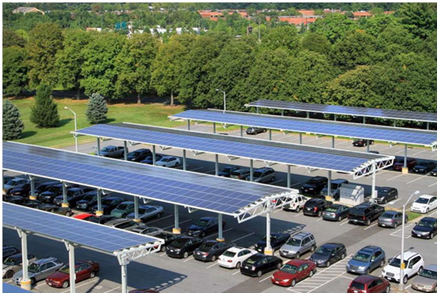
Commercial Carport Mounting