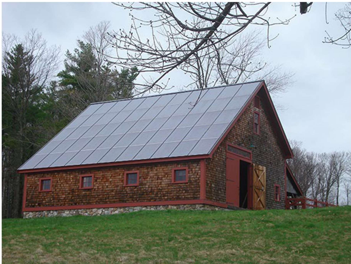
Great Hill Farm barn in Tamworth

Town of Middleton Zoning Ordinance Adopted March 11, 2017 Articles 7, 45 and 46 Adopted March 12, 2024 Amended March 11, 2025