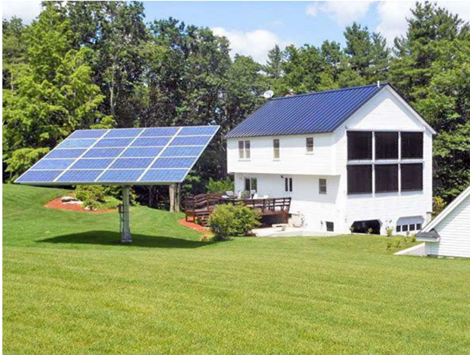
Tracker Mounted Residential System