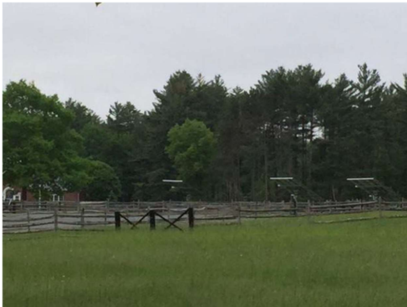
Pole-mounted system – agricultural site.