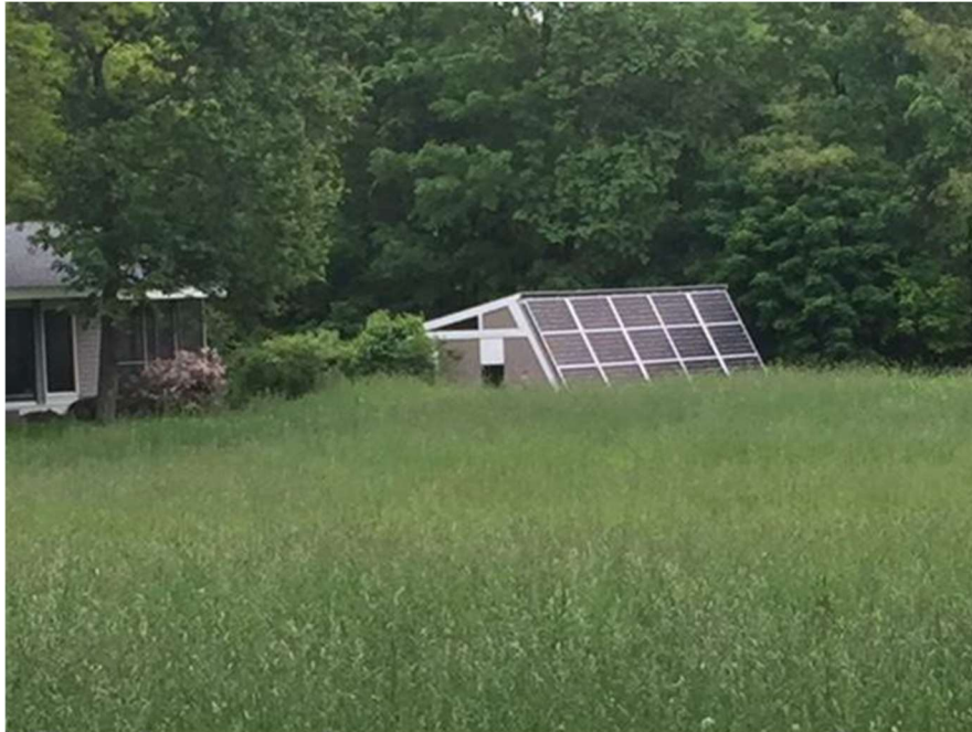
Residential Ground mounted system.